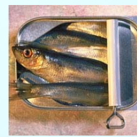
Sardine with bones