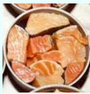
Salmon with bones