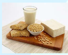
Soy and tofu